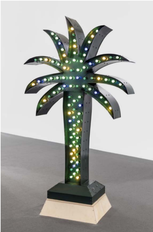
Yto Barrada Green Palm , 2016 Steel structure with galvanized sheet metal 255 x 160 x 30 cm Collection Silvia Fiorucci-Roman, Monaco Courtesy l'artiste and Sfeir-Semler Gallery, Hambourg/Beyrouth

The palm tree, emblematic of Morocco, and a recurring motif in the work of Yto Barrada, is a symbol of exoticism but also of the domestication of public space and of alienation. The sculpture Green Palm (2016), made of sheet metal, iron, and a hundred or so coloured bulbs, borrows the form of a roadside advertising sign. Barrada interrogates the uses of the palm tree, from the vast monoculture of palm oil plantations; to urban planning, where palms line avenues; to the nomadic lives of these trees, which are often uprooted to become elements of urban decor.