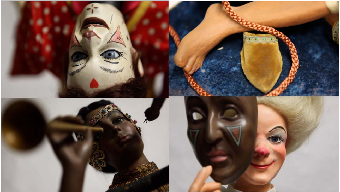
Latifa Echakhch Le prestidigitateur (film still), 2018 Video color and sound 3:06